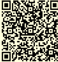
6th grade VBS 2026 Registration