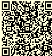
6th grade VBS 2026 Registration