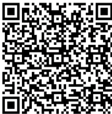
VBS 2026 Registration Form

It's time to register for VBS! Children who will be 4 years old by September 1, 2026 through current 5th graders are invited to attend. Scan the QR code to register your preschool-5th grader. Current 6th graders are invited to participate in a week of service projects during VBS and can fill out the VBS service project registration with the additional QR code. Registering your student by Monday, April 27, allows us to best plan for the week. We hope to see you at #KidsConnect VBS this year!