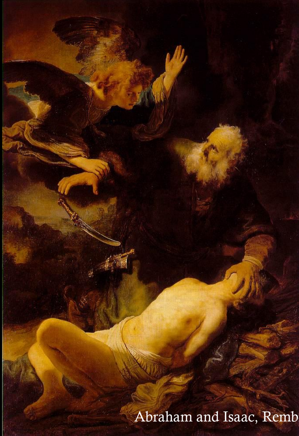
Abraham and Isaac, Rembrandt, public domain