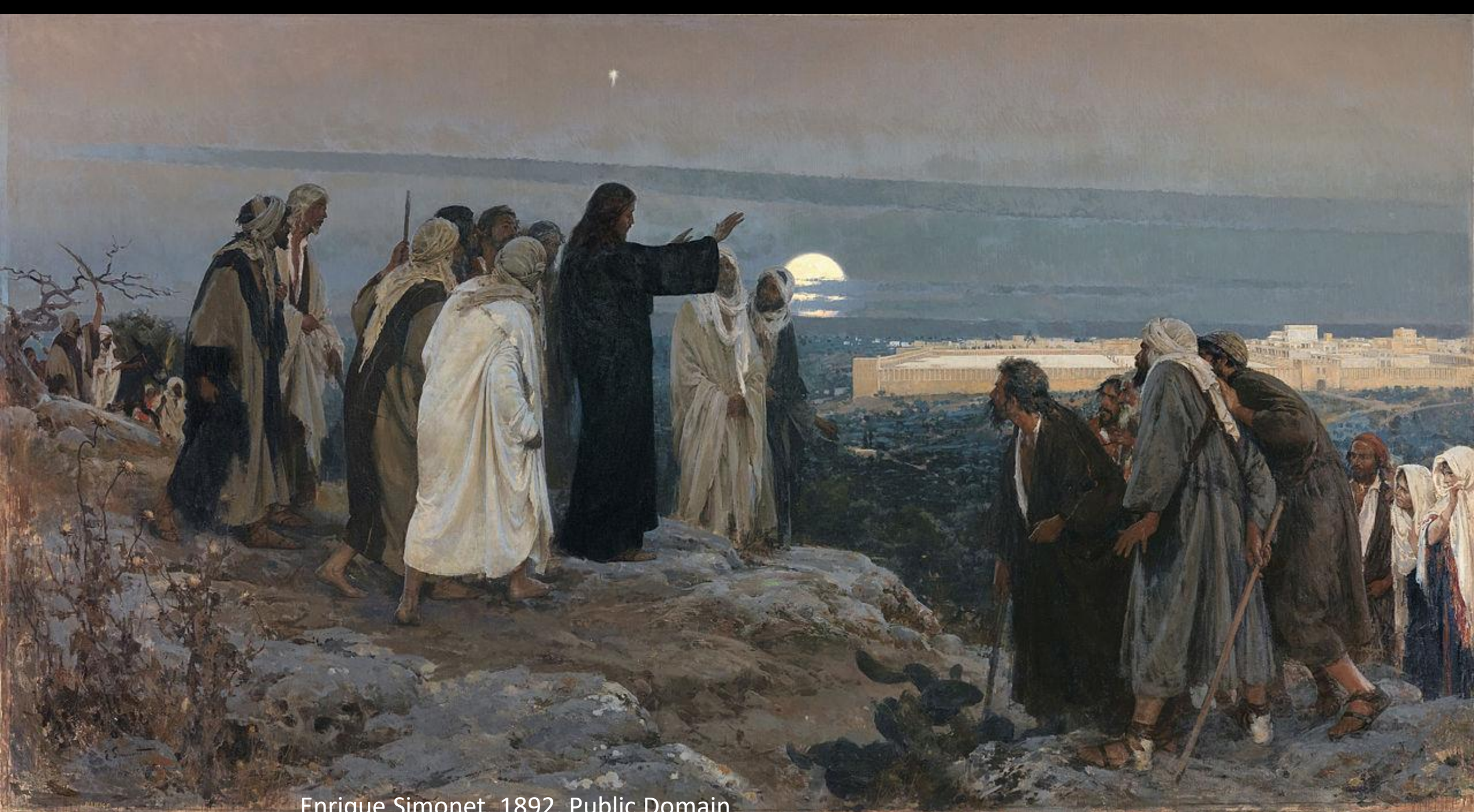
Enrique Simonet, 1892, Public Domain