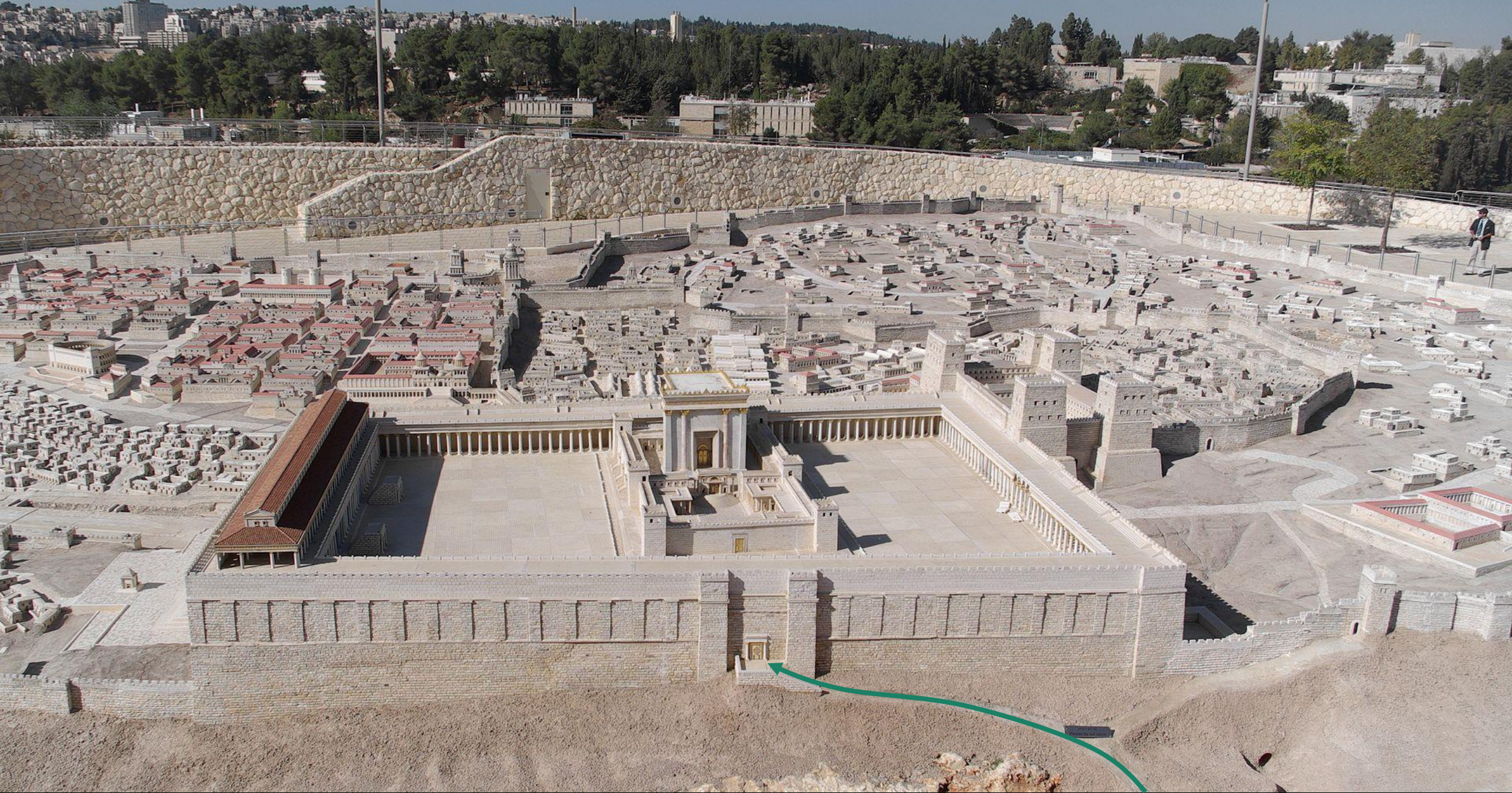
By Berthold Werner (Own work) [Public domain], via Wikimedia Commons